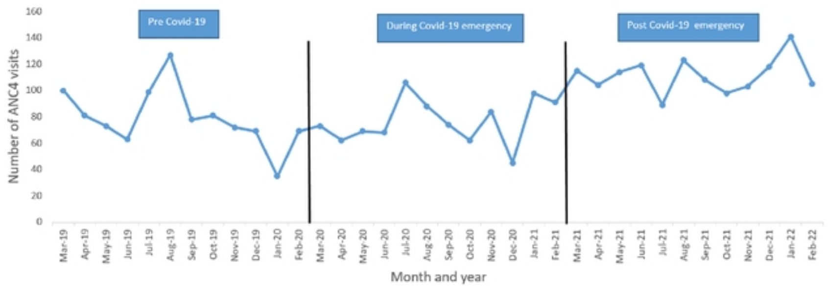
Figure 2. Monthly number of ANC4 visits at two health facilities in Kono District, Sierra Leone, March 2019-Feb 2022. *ANC4 refers to the fourth antenatal clinic visit. *Pre-COVID-19 (March 2019-Feb 2020), during COVID-19 Emergency (March 2020-Feb 2021), Post COVID-19 Emergency (March 2021-Feb 2022).

medRxiv preprint doi: https://doi.org/10.1101/2025.01.22.25320951 ; this version posted January 24, 2025. The copyright holder for this preprint (which was not certified by peer review) is the author/funder, who has granted medRxiv a license to display the preprint in perpetuity. It is made available under a CC-BY 4.0 International license .