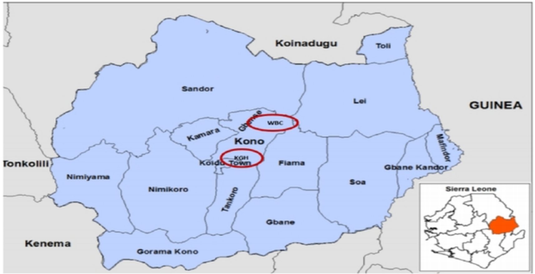
Figure 1: Map of study area