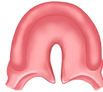
Supplementary Fig.1 NSOC and its sub-phenotypes