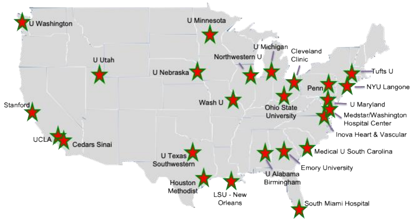
Figure 1. Institutions of the DCM Consortium Site Principal Investigators who participated in the study survey. The map shows the geographic reach of the DCM Consortium.