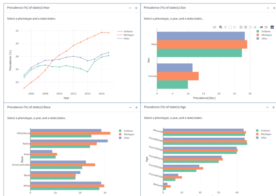
Figure 3: Charts showing prevalence in three states over time, as well as breakdowns by age, sex, and race. Users can download images of these charts.

Below the map, there are several plot options to allow users to explore time trends and summary statistics by selecting state options (Figure 3). User can use dropdown menu to select a state or states of interest. Upon selection, GeoPheno will populate a line plot showing prevalence trends over time by year, and bar plots broken down by age, race, and sex. These categories are not comprehensive. The groupings for race include White, Black, Asian, American Indian, Native Hawaiian or Pacific Islander, and other; options for sex are male and female; patient age is broken down by ten-year windows, with age groups below 40 and above 90 collapsed. These plots can be downloaded as image files for further use. At the bottom, a table view is available for users to see prevalences for all states as well as a summary statistics breakdown by demographics for the selected phenotype. All cells with counts below 11 in the table are replaced with -999 to reduce risk of patient re-identification.