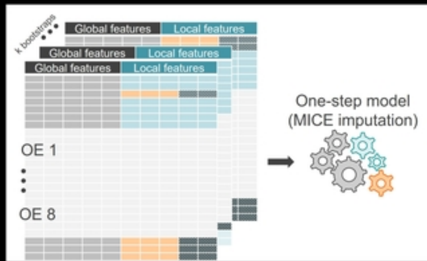
Figure 2 (subfigures combined)