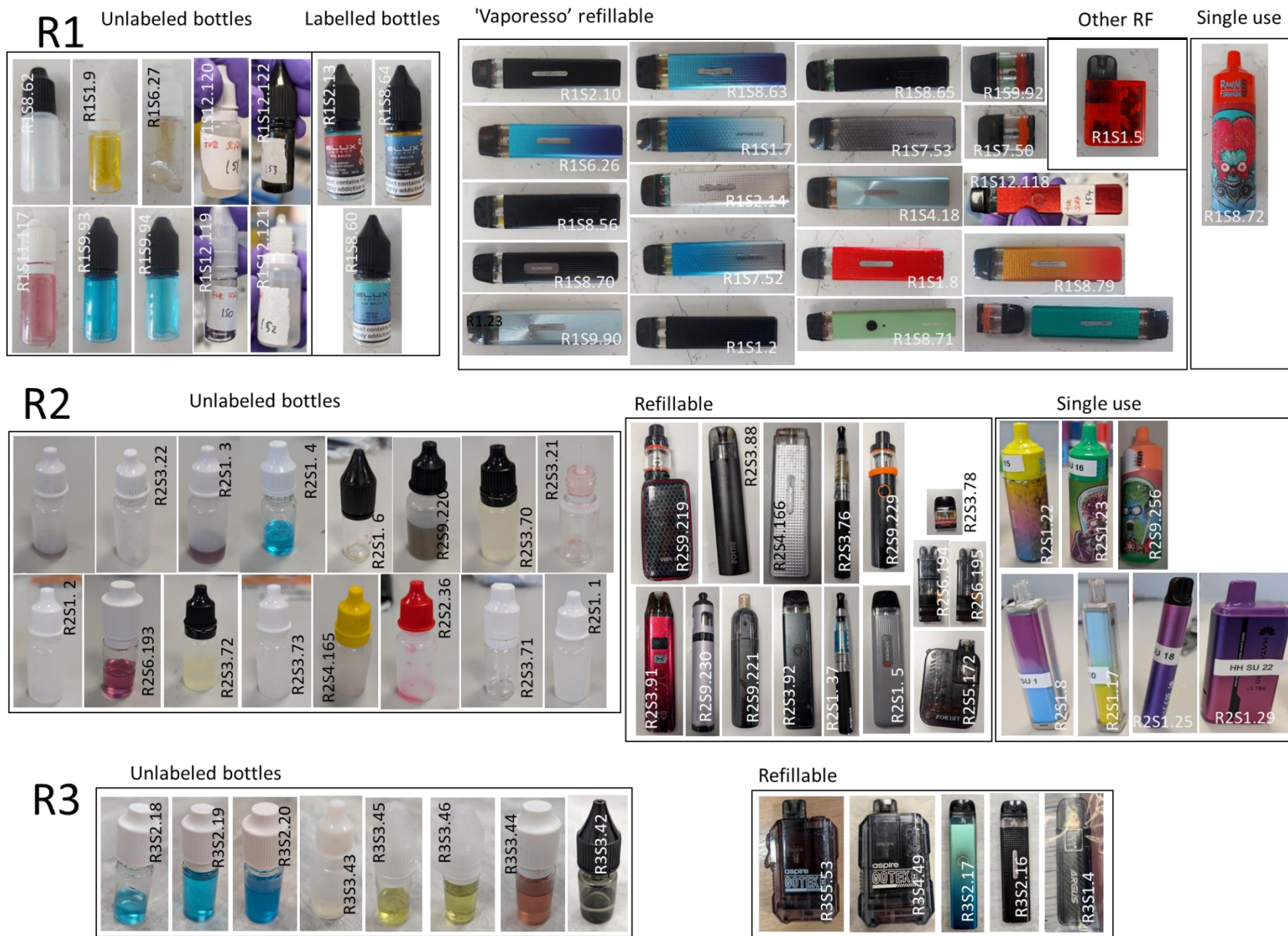
Figure 2. Presentation of SC e-cigarettes from each sampling exercise.