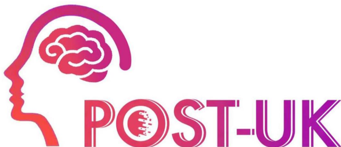
Figure 1. Trial logo