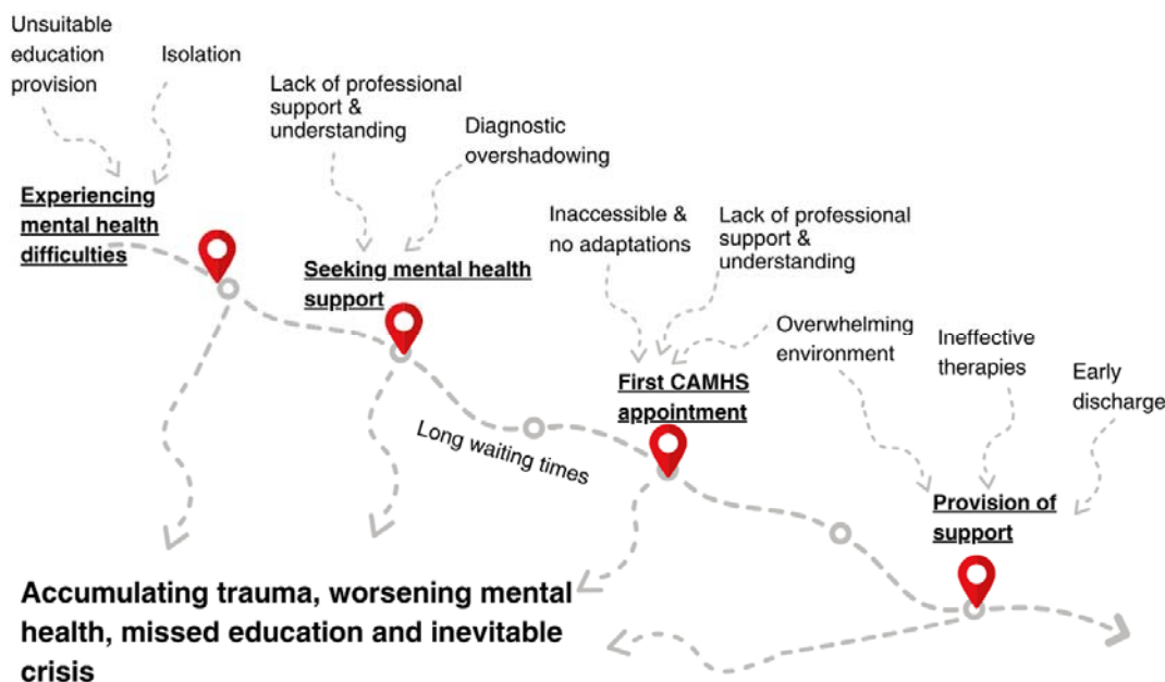
Figure 1. A summary of findings

SHORT TITLE: ACCESS TO CAMHS FOR AUTISTIC YOUNG PEOPLE