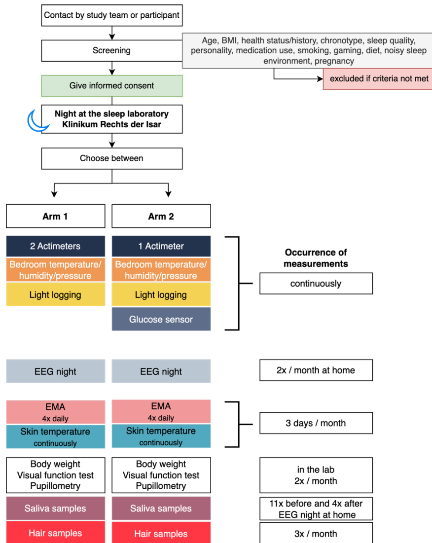
Figure 2. Timeline of onboarding steps and measurements. Participation in Arm 2 includes the same measurements as Arm 1 except that participants only wear one type of actimeter and instead additionally measure their glucose levels continuously (GCM). BMI, Body mass index; EEG, electroencephalography; EMA, ecological momentary assessment.