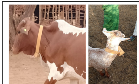
Figure 5: CatLog 2 GPS collar on a bovine (left) and goat (right)

362 For the CatLog2 GPS loggers, locally crafted collars were fashioned from animal leather, with 363 sizes tailored for goats, sheep, cattle, and camels. These collars featured an integrated pouch 364 designed to safeguard the devices against physical 365 damage during the animals' grazing activities. The 366 attachment of CatLog2 GPS devices was facilitated by 367 the use of zip-ties, which were secured around the 368 pouch to affix the device firmly to the collar.