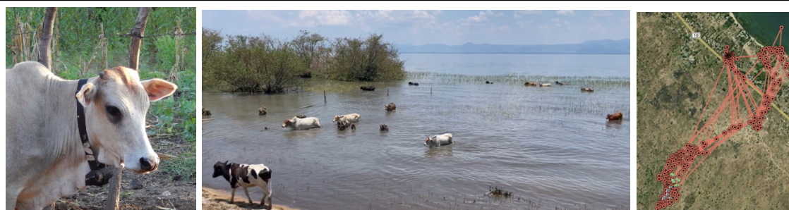
Figure 6: Cattle in Malawi wearing a satellite GPS collar (left) and cattle in water browsing on emergent vegetation often fully immersing the GPS device each day (middle) and plot of cattle movements over a 2-day period (right).

384 The manufacturer guaranteed their waterproofing, to a depth of 1m for up to 30 minutes. 385 Nevertheless, the GPS tracking devices were not fully waterproof. If the animal stayed in the water 386 for a long time, the moisture penetrated the device and caused false distances.