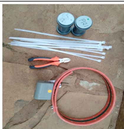
347 348 349 350 351 352 353 354 355 Figure 4: CatLog2 GPS logger (top) and Savannah GPS logger (bottom), with the items used for affixing the loggers.

346 Affixing the Savannah Tracker GPS logger was straightforward due to its adjustable neck collar.