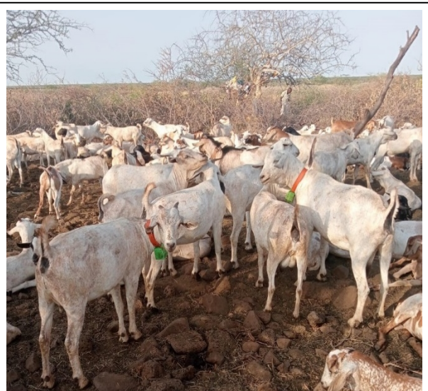
Figure 1: Goats in Marsabit wearing FindMy collars

276 The GPS trackers we used were adapted from dementia care technologies 277 ( https://www.techsilver.co.uk/product/satellite-gps-tracker/ ). This is a satellite-based system that 278 does not require a mobile signal to locate the animal quickly and easily. It provides regular updates 279 on any detected movement of the herd and 280 alerts a mobile phone with updates every 5 281 minutes. It is possible to subscribe for location 282 fixes every 2 minutes but this increases 283 subscription costs and reduces battery life. 284 The GPS tracker is small (H 6.83 cm x W 5.13 285 cm x D 2.14 cm) and lightweight (90g with 286 batteries). It uses four AAA batteries and if the 287 battery power is low, a warning alert gives 2-3 288 days notice.