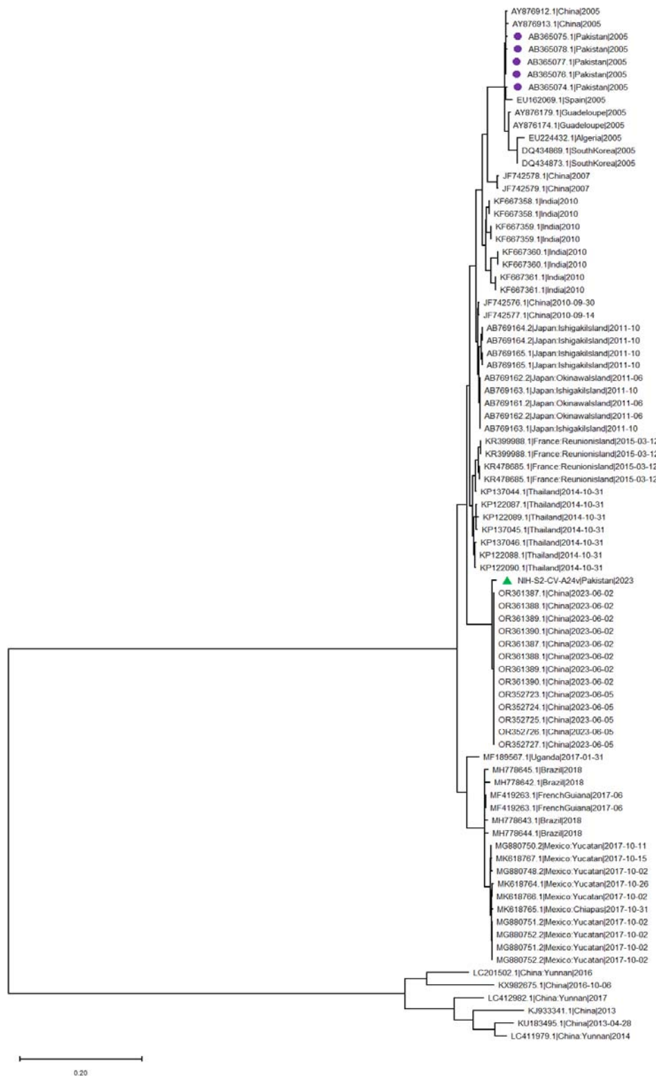
Figure 2 Maximum likelihood phylogenetic tree of coxsackievirus A24 variant (CVA24v) of VP1 Region. The tree was generated through an IQtree with 1000 bootstraps. The study sample is marked with a blue triangle