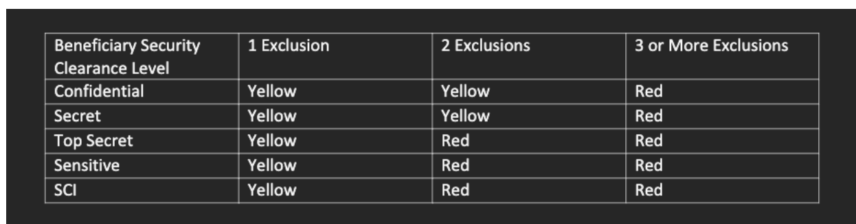
Fig. 2. Insider Threat Management Model

Fig. 2. We propose an Insider Threat Matrix for TRICARE beneficiaries based on their security clearance level. Approximately 215,000 active-duty military officers have access to classified information and rely on TRICARE. TRICARE administrators need to ensure providers with exclusions have no access to these beneficiaries.