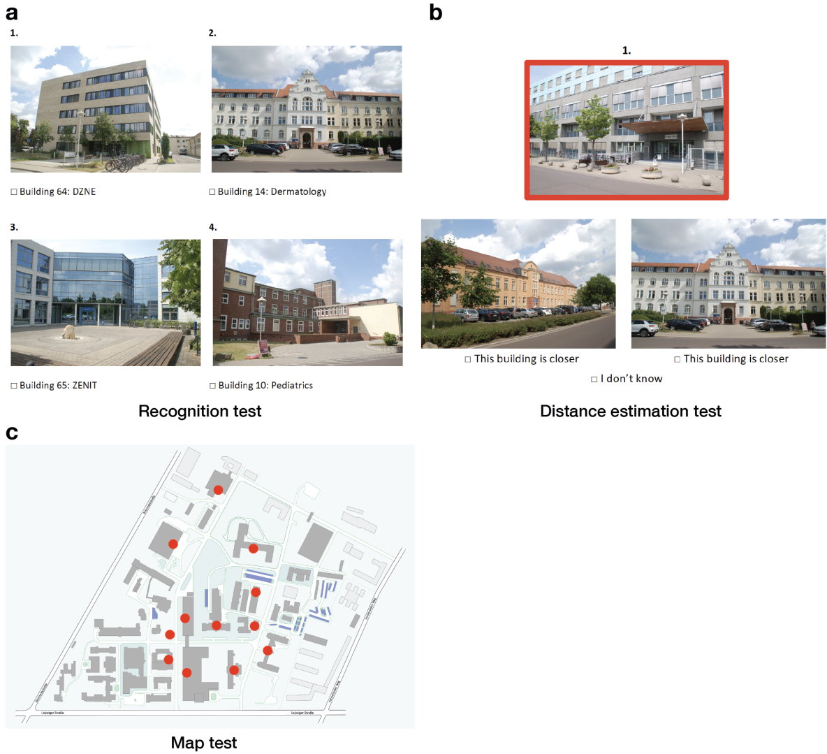
Supplementary Figure 3. Spatial memory test implemented in the familiarity questionnaire to assess the participants' prior knowledge of the campus area in three sub-tests (maximum score: 28). (a) Recognition test: First, participants had to indicate from a list of pictures showing 12 campus buildings (including the 5 Poles of the mobile wayfinding task), which of the buildings they recognize (shown are 4 example buildings). (b) Distance estimation test: Next, they saw 4 triplets of the 12 buildings and were asked to indicate, which of the two buildings in the lower row lies closer to the reference building in the upper row (shown is one example triplet). (c) Map test: Finally, for the buildings they knew, they had to assign the buildings from the recognition test to dots on a map of the campus, in this way identifying their location.