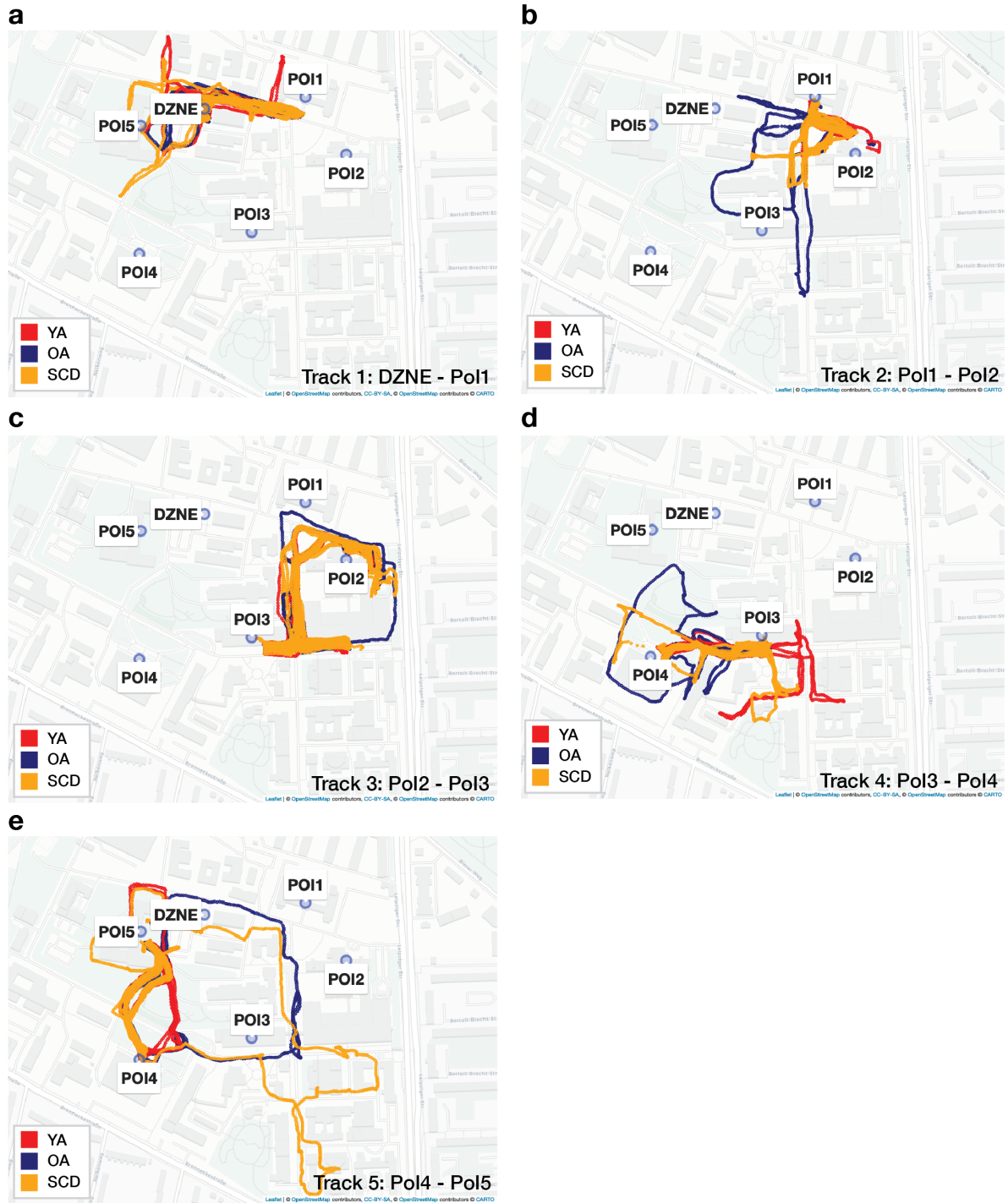
Supplementary Figure 1. Movement trajectories of the three participant groups (red: younger adults; blue: healthy older adults; yellow: older adults with subjective cognitive decline) on (a) track 1; (b) track 2; (c) track 3; (d) track 4; (e) track 5 of the mobile wayfinding task.