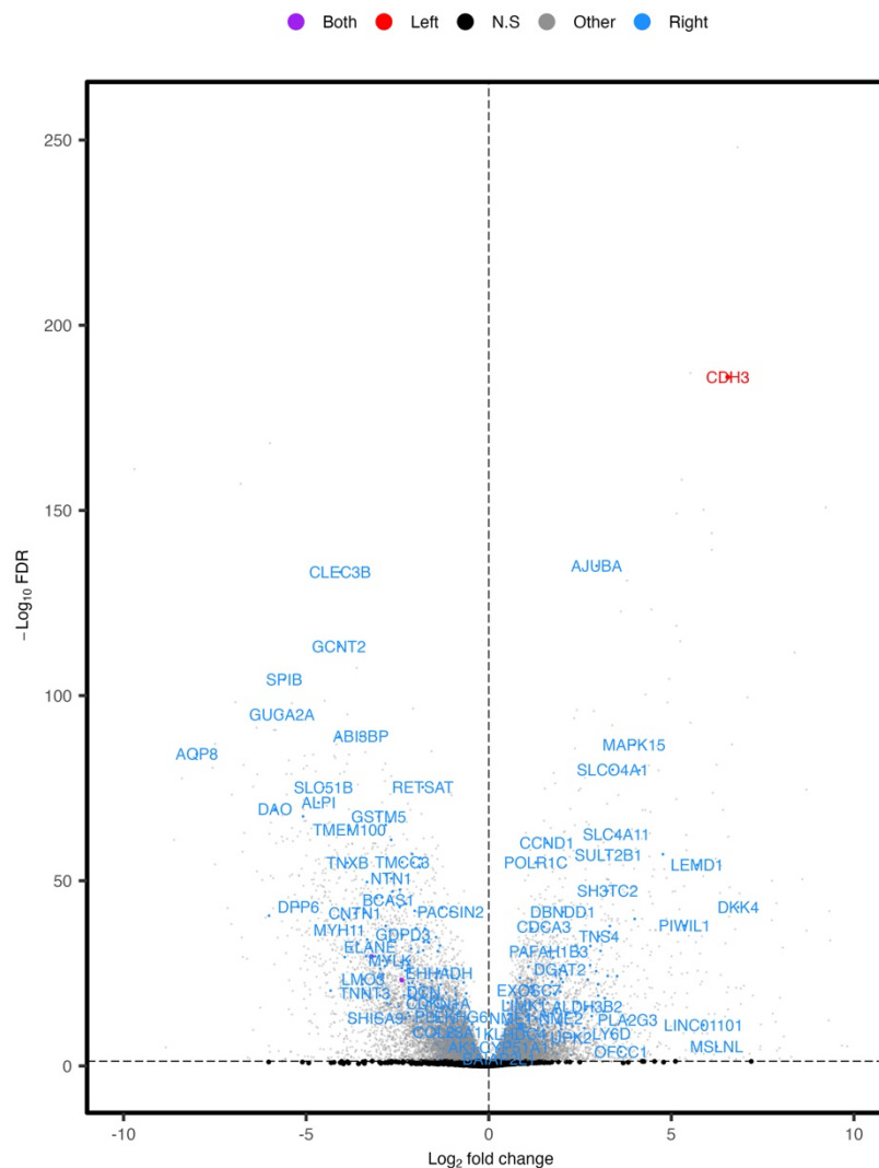
271 Figure 2: Volcano plot demonstrating the significance of genes corresponding to fructose- 272 risk DMRs in TCGA-COAD expression data. Genes were color coded depending upon whether 273 they were identified as fructose-risk DMRs in right (blue), left (red) or purple (both) analyses. 274 Positive log 2 fold changes correspond to DEGs overexpressed in CRC tumors versus matched 275 NAT.

255 256 257 258 259 260 261 262 263 264 265 266 267 268 269 270