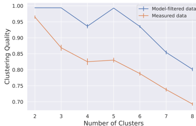
Fig. 2. Clustering quality for different numbers of clusters for clustering on original measured data (orange line) and model-filtered data (blue line) data. Mean clustering quality with 95 % confidence intervals over repeated (100 times) clustering on subsample (80%) of dataset is shown. Mean clustering quality and results of a two-tailed Student's t-test for mean quality of clustering are given in Table II.

In contrast to the clustering on the original measured data, the clustering quality on model-based filtered data was found to be significantly higher for all configurations of number of clusters (see Fig. 2 for the results of clustering, Table II for the results of the t-test, and Supplementary Table II for enrichment results). While on the original measured data, the quality decreased significantly already after increasing the