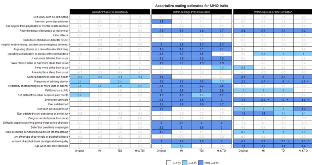
Figure 1. Genetic signatures of assortative mating across Mental Health Questionary (MHQ) traits. Cell shades correspond to the significance strength of each estimate, from white ( p > 0.05 , non-significant), light blue ( p < 0.05 , nominally-significant), to dark blue (FDR q < 0.05 , FDR-significant). The estimate reported as a percentage is shown in the center of each cell. An asterisk in the cell indicates a significant difference of the SES-conditioned estimate with respect to the original estimate (difference- p < 0.05 ). Abbreviations: Household income (HI); Townsend Deprivation Index (TDI).

model different aspects of AM, we observed consistency across the three methods. Interestingly, the MHQ-derived traits showing evidence of AM in at least two analyses were all related to substance use (mostly alcohol consumption) and emotional well-being. The two traits that showed significant estimates in all analyses (WSib- and WSps-PRS correlation FDR q < 0.05 and GPD p < 0.05 ) were Frequency of drinking alcohol (UKB Field ID: 20414) and General happiness with own health (UKB Field ID: 20459). Consistency between WSib- and WSps-PRS correlation analyses (FDR q < 0.05 in both) was also observed for Amount of alcohol drunk on a typical drinking day (UKB Field ID: 20403), Ever taken cannabis (UKB Field ID: 20453), and Recent feelings of tiredness or low energy , UKB Field ID: 20519). The WSps-PRS correlation and GPD analyses showed significant results (FDR q < 0.05 and p < 0.05 , respectively) for Frequency of consuming six or more units of alcohol (UKB Field ID: 20416) and Felt distant from other people in past month (UKB Field ID: 20496). Below, we described the results obtained in each analysis and the differences observed after adjusting for SES variables.