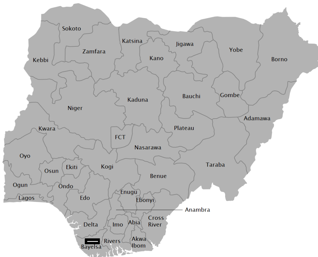
Figure 1 Geographical location of the study site indicated by the rectangle on the map.