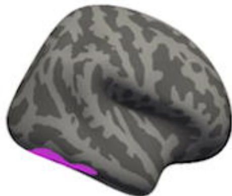
B. Sleep disorders