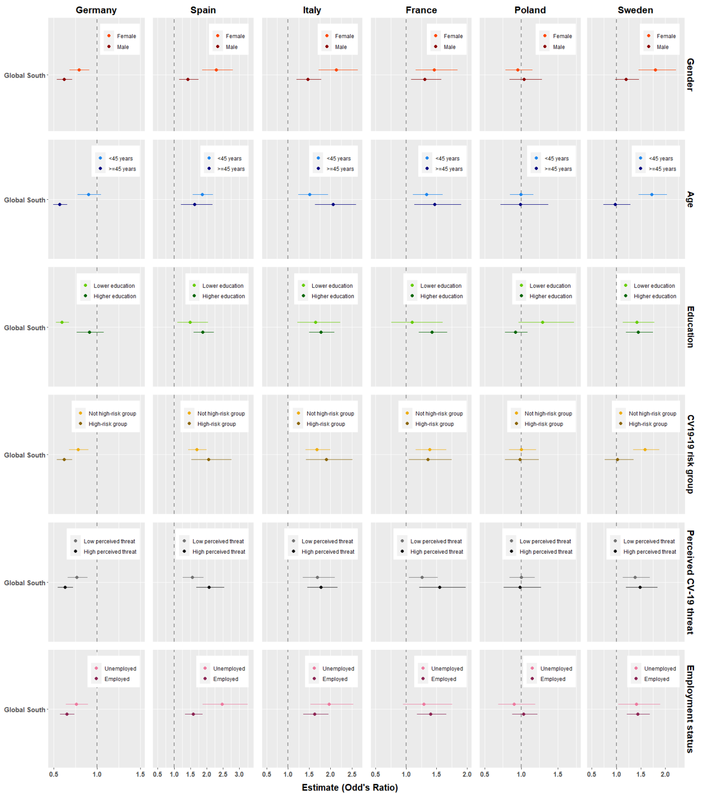
Figure S3 – Country of residence attribute: Heterogeneity by respondent’s characteristics (by country)