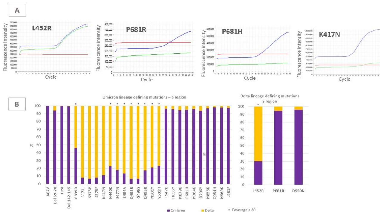
Figure 2. A-Real-time RT-PCR for VOC typing. Blue curve: presence of mutation; green curve: absence of mutation (presence of wild type); red curve: negative control. B)- Proportion of sequencing reads obtained for the S region by the whole genome sequencing technique matching with VOCs Omicron or Delta for the analyzed mutations that define the lineage.

*Positions in which the number of reads were less than 80.