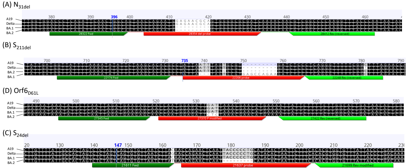
Figure 2. Position of the BA.1/BA.2-specific reaction components. The locations of the primers and probe of each reaction are indicated with respect to the specific mutation. The following sequences were used for the alignments: A19 (Wuhan strain) - NC_045512, Delta sequence: Spain/CT-HUVH-04902/2021|EPI_ISL_2284972, BA.1 sequence: South Africa/NICD-N21672/2021|EPI_ISL_6704871, BA.2 sequence: Israel 8001158. Analysis was performed using the MUSCLE alignment tool embedded in the Geneious software package.