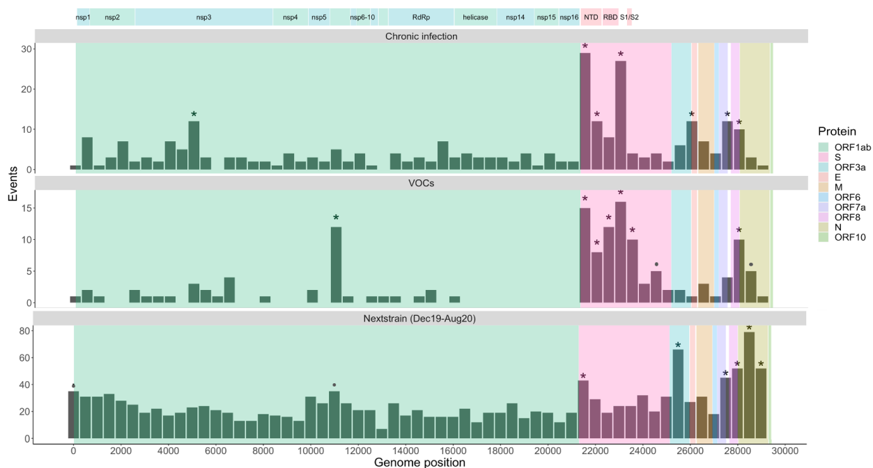
Figure 1. Number of substitutions observed along the SARS-CoV-2 genome, in bins of 500 nt. The upper panel displays substitutions observed at any time-point of the twenty-seven chronic infections. The middle panel displays lineage-defining mutations of the five currently recognized VOCs. The lower panel displays substitutions observed globally during the first nine months of the pandemic, mostly before the emergence of VOCs. Asterisks and dots mark bins enriched for more substitutions ( P < 0.05 and P < 0.1 , respectively, Methods). The genomic positions are based on the Wuhan-Hu-1 reference genome (GenBank ID NC_045512), and the banner on the top shows a breakdown of ORF1a/b into individual proteins, and domains for the spike protein (see main text).

have been shown to enhance affinity to the ACE2 receptor and allow for better replication 34,35 , whereas other mutations, both at RBD and NTD, are known to enhance antibody-evasion 31,36,37 . Notably, chronic infections exhibited mutations both in the first NTD residues observed in the “neutral” pattern described above, but also in later positions. The most commonly observed substitutions in chronic infections were in the spike protein: E484K/Q and various deletions in the region spanning the NTD supersite, particularly amino-acids 140 through 145, all shown to confer antibody-evasion 38 . Chronic infections shared the enrichment of ORF3a/ORF7a/ORF8 mutations with the “neutral” set, but lacked an enrichment across most of the N protein. Overall, it seems that mutations in chronic infections are predictive of those occurring in VOCs, as has been noted previously 2 .