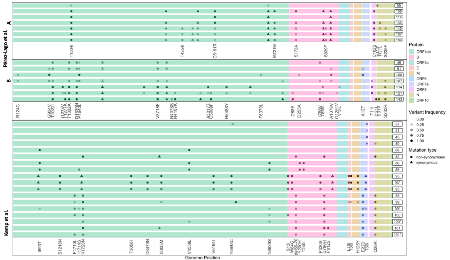
Figure 4. Polymorphic populations observed across patients. Each series of boxed lines represents a patient, and each line represents a sequenced time-point with time since infection on the right. The different open reading frames are color-coded. For each patient, only mutations relative to the first time point sequenced that appeared at a frequency ranging from 20% to 100% are shown.

consensus sequence level, which is defined here as mutations present at a frequency of 80% or higher. We thus conclude that the most likely explanation for the highly dynamic polymorphisms observed, is the existence of distinct populations residing in different niches, which may correspond to different infected organs, or niches within an infected organ.