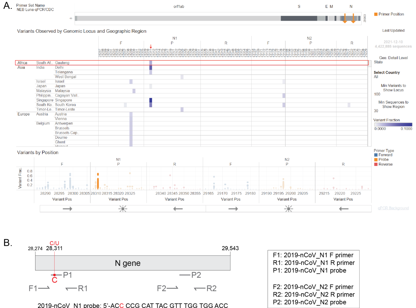
Figure 1. The Omicron N gene contains a mutation targeted by the 2019-nCoV_N1 detection probe. The CDC 2019-Novel Coronavirus (2019-nCoV) Real-Time RT-PCR Diagnostic Panel includes two primer-probe sets that target the SARS-CoV-2 N gene, named 2019-nCoV_N1 and 2019-nCoV_N2. A) Visual depiction of Omicron variant mutation within the N1 probe site generated using the Primer Monitor online tool (Tableau worksheet exported from Primer Monitor tool, primer set name “NEB Luna qPCR/CDC”). The Omicron variant from Gauteng, South Africa and the mutation are annotated with a red box and an arrow, respectively. Importantly, only one mutation overlapping with the N1 probe region was identified as of 12/10/2021. A second mutation in this region was identified during the preparation of this manuscript (Supplemental Figure 2A). B) Schematic representation of the two CDC primer-probe sets. Each set includes one forward primer (F), one reverse primer (R), and one fluorescent probe (P). The SARS-CoV-2 Omicron variant has a C to U mutation at position 28,311, which is within the 2019-nCoV_N1 probe (P1) target sequence. Not drawn to scale.

It is made available under a CC-BY-ND 4.0 International license .