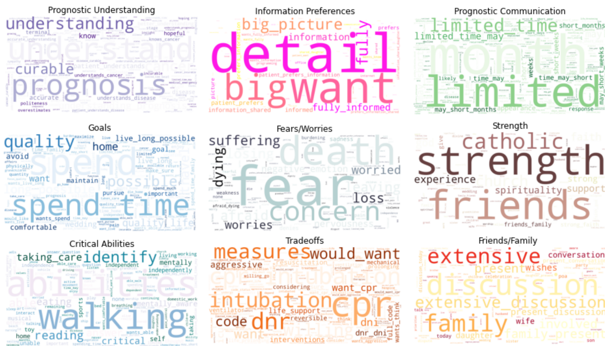
Figure 2: Wordclouds for Prognosis (1st row) and Goal (2nd/3rd row) Subdomains.

In Figure 2 , we present the most informative n-grams and Empath categories associated with each SIC subdomain. Features with high associations (low p-values) to a subdomain are larger in the WordCloud. Notable features by prognosis subdomain include: prognostic understanding ( prognosis, understanding, curable, helpful, understands_disease, know ), information preferences ( big_picture, detail, fully_informed ), and prognostic communication ( limited_time, short_months ). Notable features by goal subdomain include: goals ( spend_time, quality, home, live_long_possible, comfortable ), fears/worries ( fear, concern, loss, dying, suffering ), strength ( strength, friends, catholic, spirituality ), critical abilities ( walking, taking_care, reading, independently, self ), tradeoffs ( intubation, dnr, code, life_support, would_want, measures, considering ), and friends/family ( family, extensive, discussion, wife, daughter, conversation ).