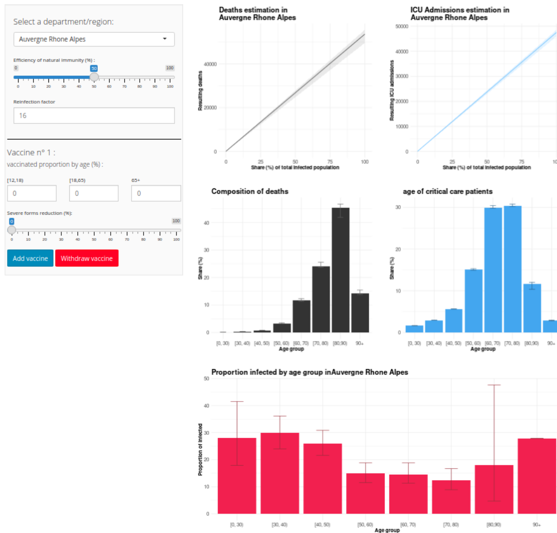
Fig. 1: COVimpact user window.