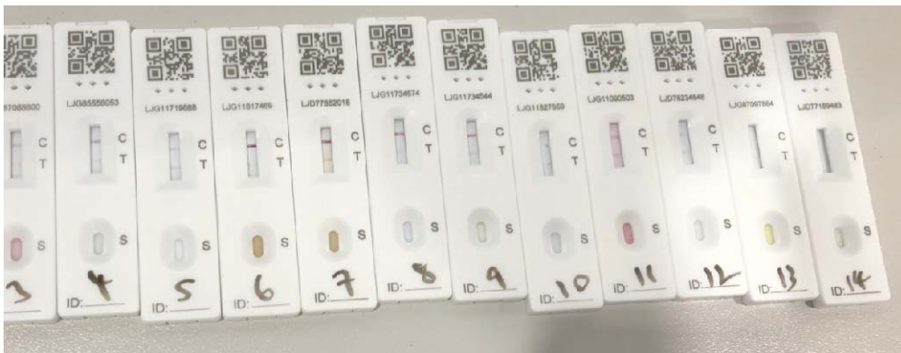
Figure 3: The SARS-CoV-2 lateral flow device results following administration of the 4 sweeteners