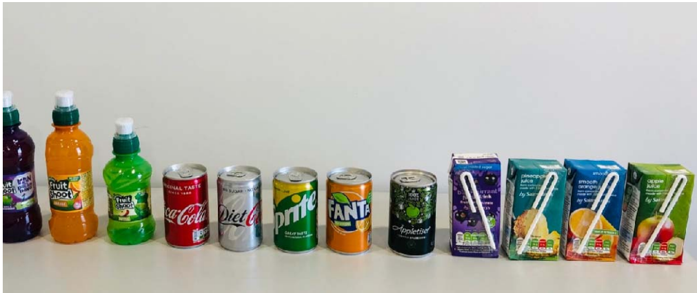
Figure 1a, b: The 14 soft drinks that were included in this study in original packaging (a) and sterile universal containers (b)