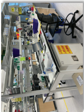
black station, scribe