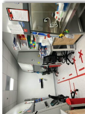
red station, neutralization