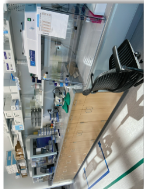
green station, PCR setup