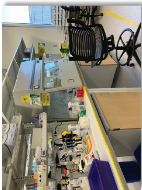
yellow station, RNA extraction