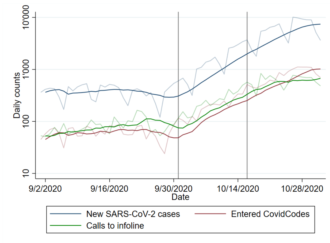
Figure 2: Evolution of key statistics in Switzerland for the months of September and October 2020. Transparent lines are numbers from daily reporting, solid lines reflect 7-day moving averages. Vertical grey lines mark cut-off dates for the different time strata utilized in the analysis.