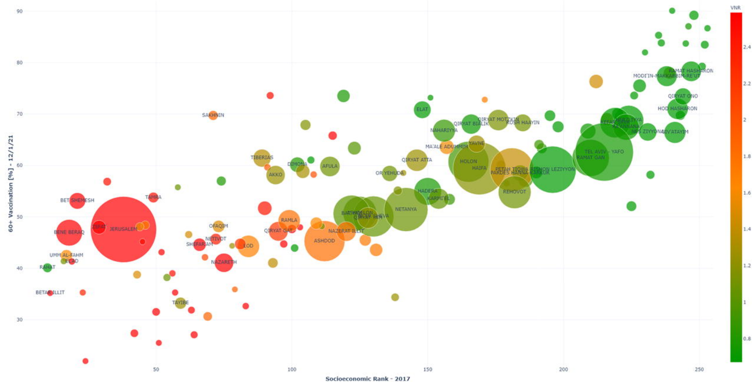
60+ Vaccination vs. Socioeconomic Rank Size = Population 60+, Color = Vaccination Need Ratio (VNR)