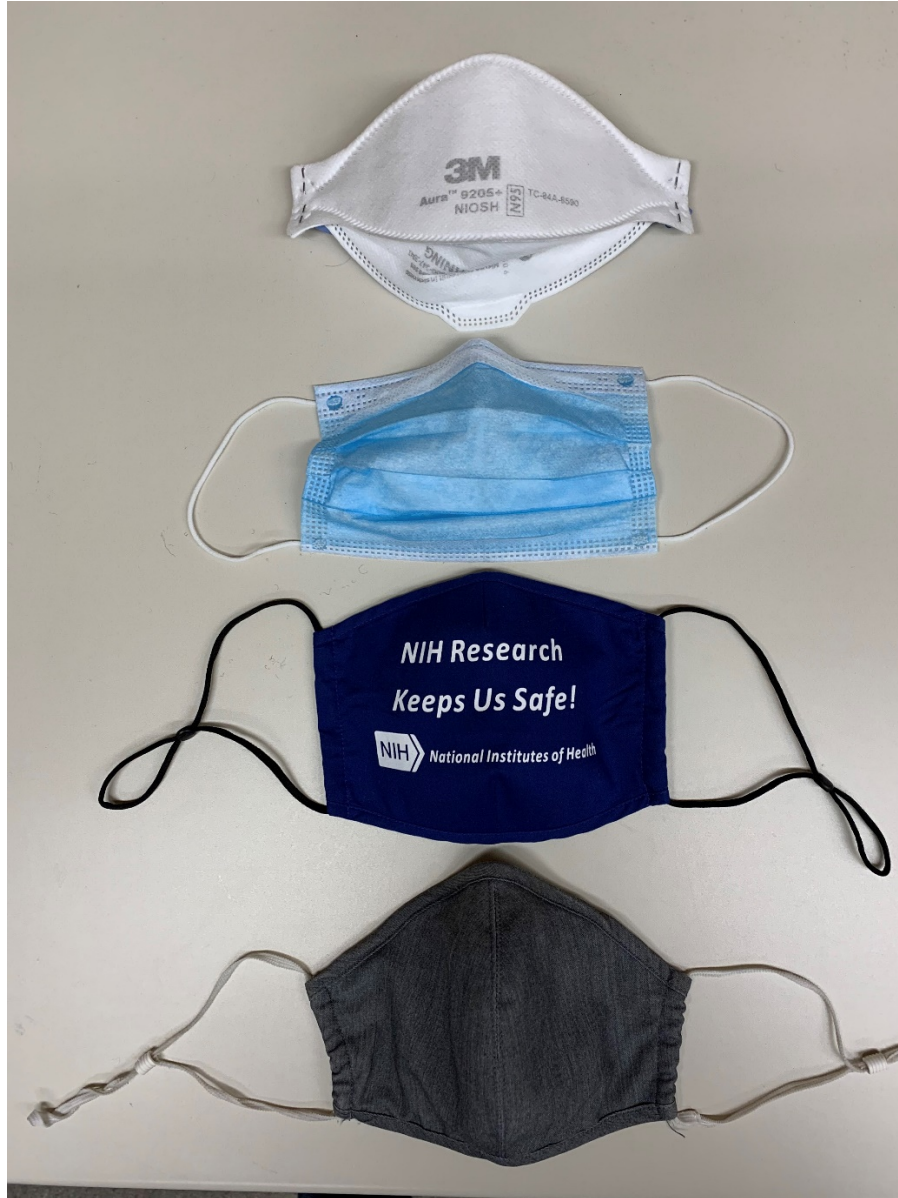
FIGURE S3. Four masks used for humidity measurements. From to top bottom: 3M 9205 N95 mask; NIH stockroom surgical mask; NIH stockroom polyester-cotton blend two-ply cloth mask; double-ply 100% cotton mask, purchased online from https://mandalascrubs.com/products/face-mask