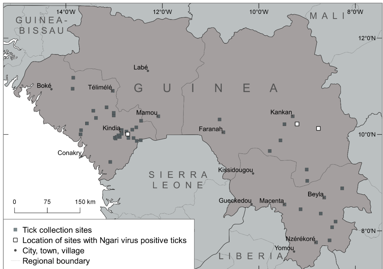
Fig.1 Map of collection sites with depicted locations of Ngari-positive tick detection

** – here “Ngari-positive cows” means cows from which the Ngari positive ticks were collected