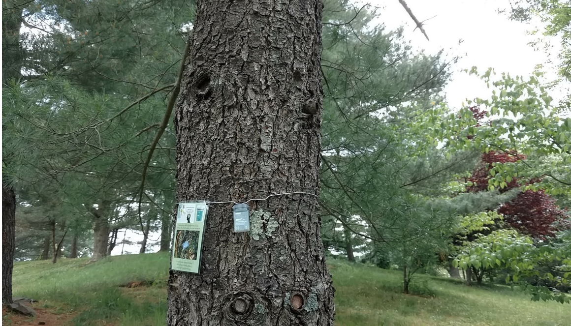
Figure S2: Outdoor light sensor. All outdoor light sensors were hung 1 meter off the ground facing North.