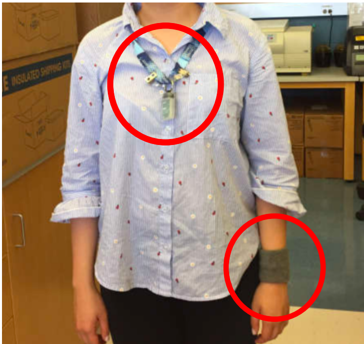
Figure S1: Example of the light sensor (worn around the neck) and wrist temperature sensor (worn around the wrist).

2. Chronobiology, Faculty of Health and Medical Sciences, University of Surrey, UK. *corresponding author