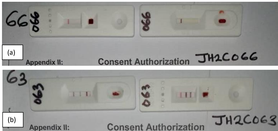
Figure 2: Pictures of test cassettes with results, on participants' consent forms. (a) Both cassettes show negative results for participant 66. (b) Both cassettes show IgM and IgG positive for participant 63. In (b), the FDA-EUA-Kit is pictured on the right.

Care was taken to place samples from each participant in both sets of test cassettes at the same time, with the results read from both after 10 or 15 minutes accordingly. Pictures of both cassettes placed on the consent forms of the participant were taken by the research assistants, as further evidence of test carried out, to eliminate any doubts over tabulated summary sheets as shown in Figure 2 for two participants.