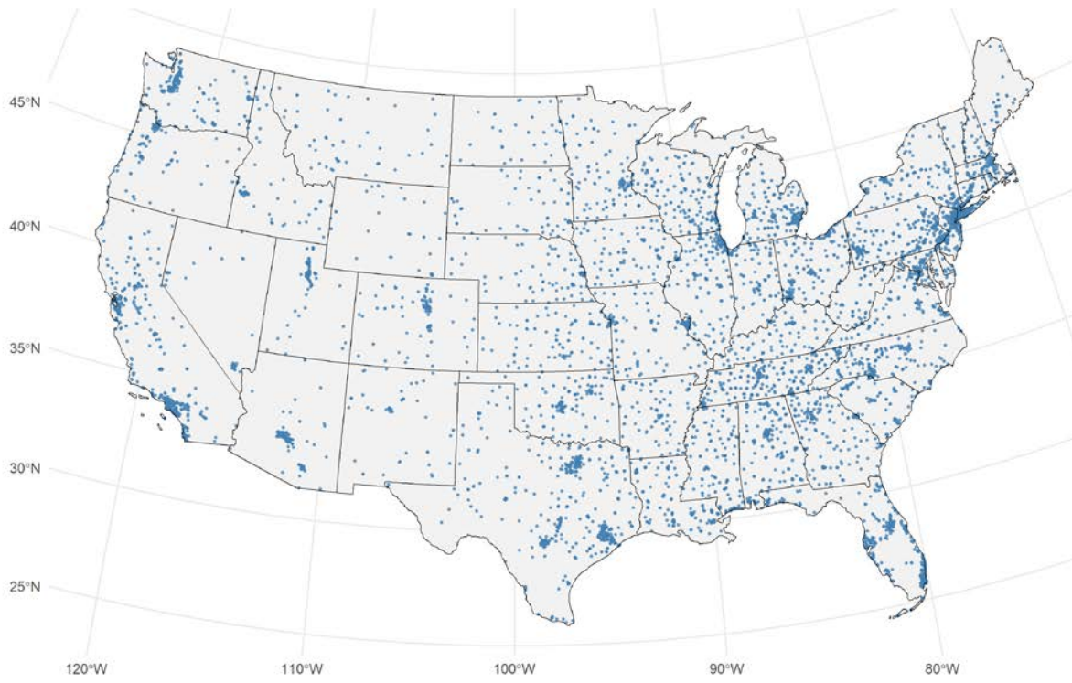
Figure S1. Locations (N = 6,236) offering SARS-CoV-2 testing in the 48 contiguous United States and DC.