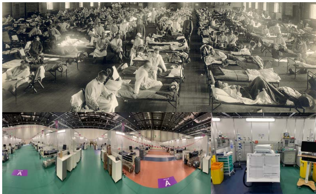
Figure 3: Field hospitals in pandemics: 1918 vs 2020