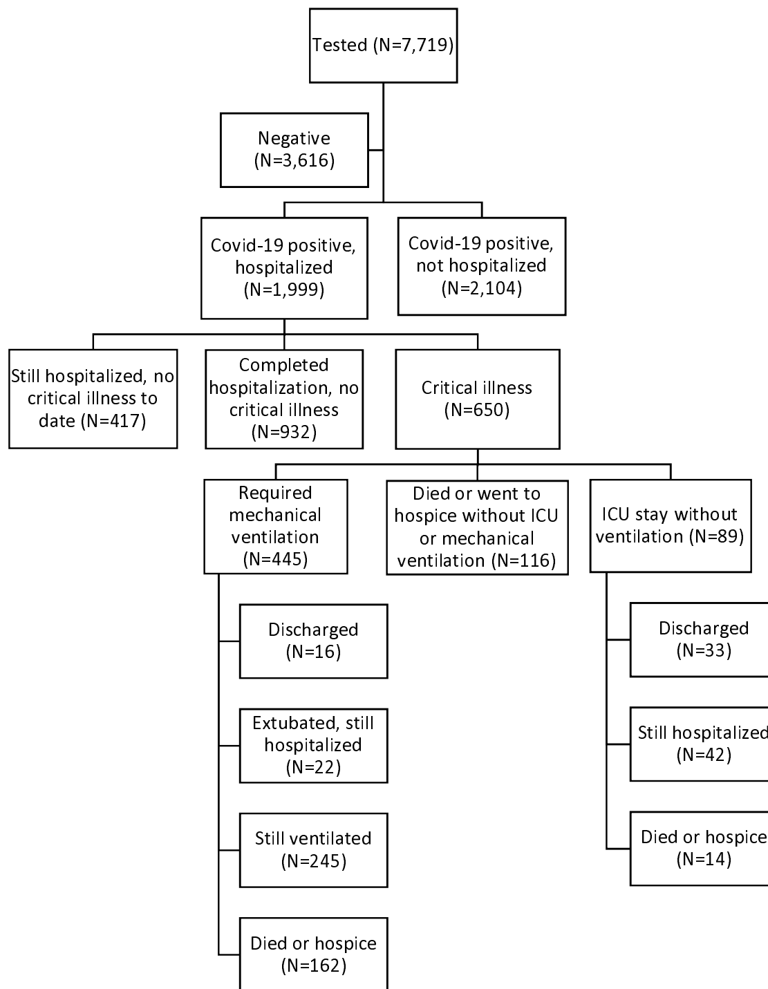
Figure 1: Flow diagram of included patients