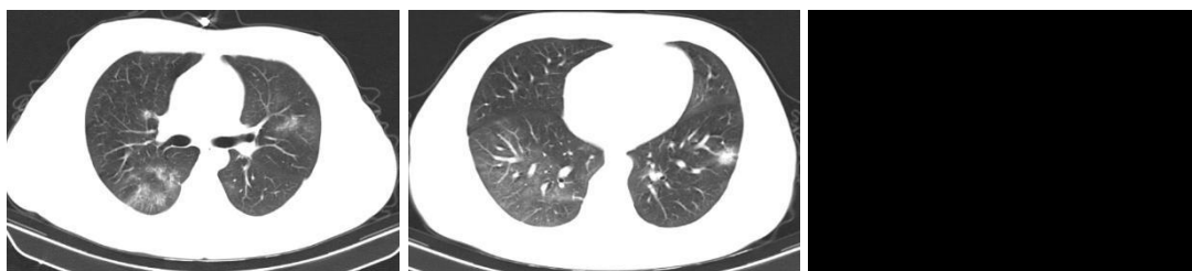
Fig2. Chest CT images of a 26-year-old patient with COVID-19. a Chest CT images obtained on February 2, 2020, showed ground glass opacity in both lungs on day 5 after symptom onset. b Images taken on February 12, 2020, indicated the lesions increased obviously. c Images taken on February 19, 2020, revealed bilateral ground glass opacity absorbed dramatically, and the patient discharged from hospital and return to the local hospital.