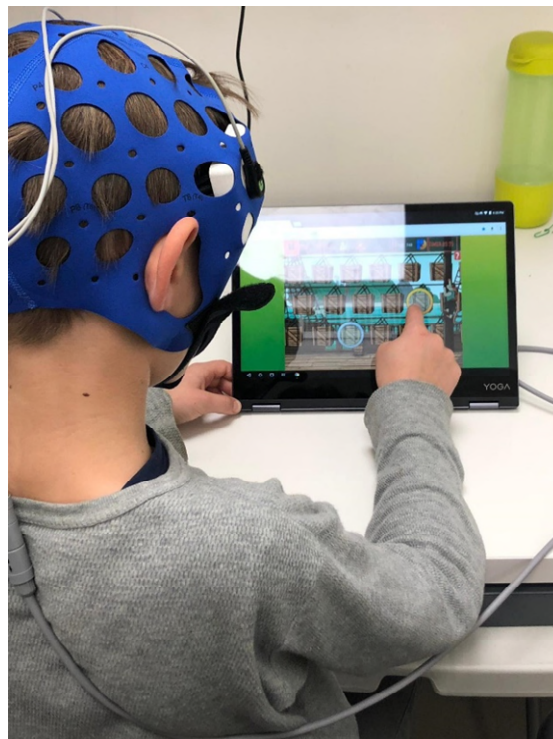
Figure 3. A treatment session of tES combined with EF training. Participants completed 20 minutes of EF training while tRNS or tDCS was delivered to them during this period.

likelihood of contextualization (which is often the result of extensive training using a single task) and increases the likelihood of transfer (Perlman et al. , 2016). While the present cognitive training has been used in previous studies that aimed to improve academic performance in typically developing children (Wexler et al. , 2016), and in some preliminary studies in children with ADHD (de Oliveira Rosa et al. , 2019), the outcome measures in previous studies never included ADHD-RS, which prevented us from estimating the effect size expected from such training alone. As our study focused on comparing the efficacy of two tES methods, rather than on EF training per se, a detailed description of the EF training protocol is beyond the scope of this paper, but can be found elsewhere (see (Wexler et al. , 2016)) and the supplementary information section.