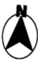
Figure 1: Map showing the seven COVID-19 sentinel sites across Malawi, July – December 2022

HF: health facility, POE: point of entry