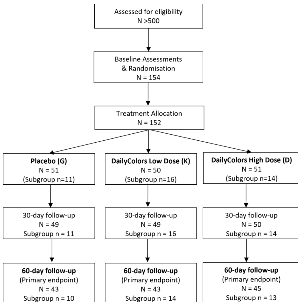
Figure 1. CONSORT Chart showing flow of participants through the study