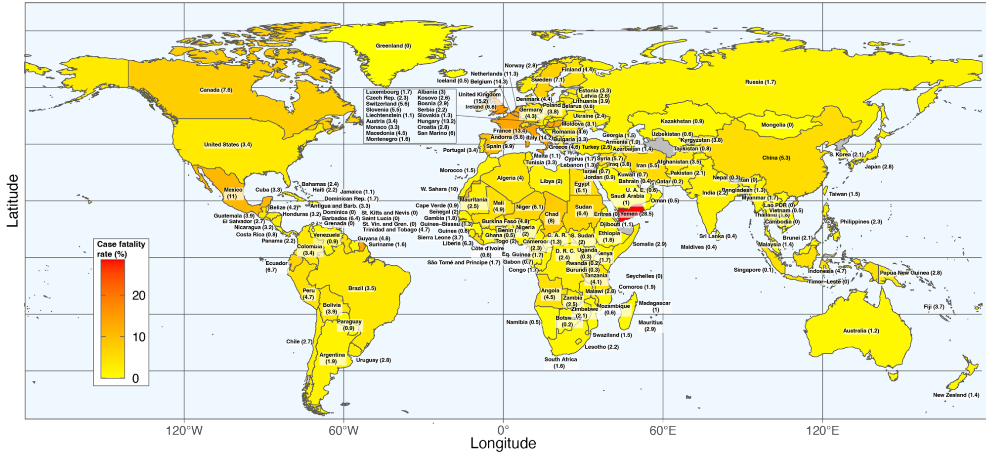
Figure 1. Case fatality rate (%) of COVID-19 by country as at 30 th June 2020.