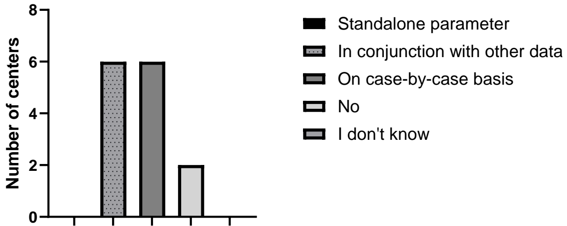
Fig. 2 Use of perfusion parameters in decision whether kidney is transplantable