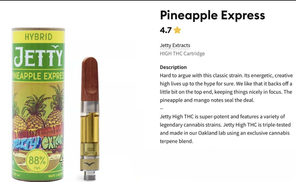
Figure 1. Examples of Selected Cannabis Vape Product Descriptions from a Large Cannabis E-Commerce Website