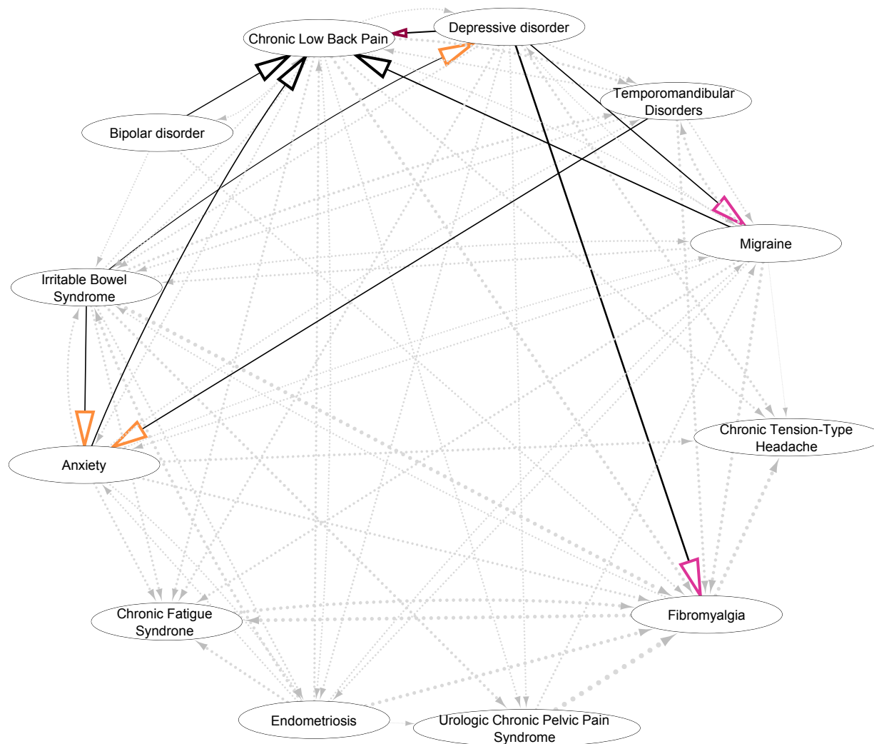
91 92 Fig 1. The overrepresentation of specific pairwise relations between COPC and mental conditions, in 93 females and non-White races. Each node represents either a specific pain condition or mental disorder. 94 Arrows represent significant trajectories of sequential occurrences of conditions based on reference 95 demographics (white, non-Hispanic, or male). Solid edges with hollow triangle arrows represent further 96 enrichment for specific demographic subgroups that are color-coded: each Black arrow indicates that for 97 the specific directed pair of conditions Black or African American persons have significantly higher risk in 98 comparison to White persons. Likewise, orange arrows for Hispanic or Latino persons as compared to 99 non-Hispanic persons, purple arrows for females compared to males, and dark purple arrows for