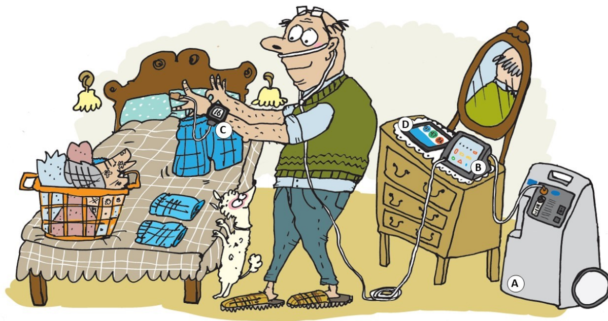
Figure 1 Artistic presentation of the setup of automated oxygen titration in the patient's home. (A) Oxygen concentrator, (B) Automated oxygen titration device, (C) Wrist pulse oximeter, (D) Patient tablet