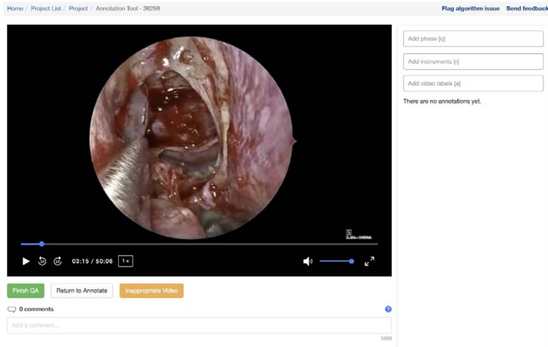
Figure 1. Annotation platform. The TouchSurgery™ enterprise interface with options for the participant to annotate the video via a drop-down box.