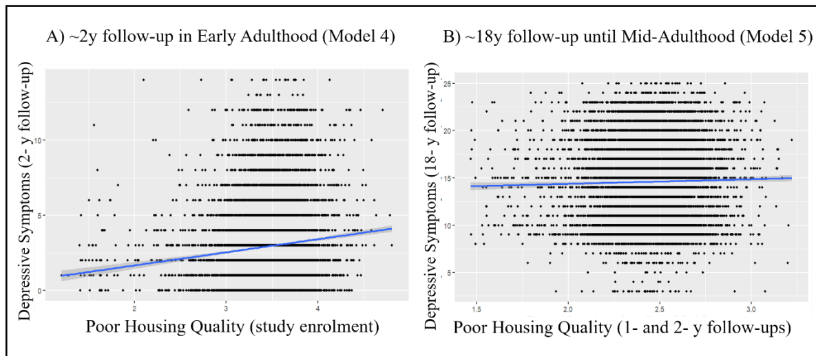
Figure 1. Longitudinal associations between A) poor housing quality at study enrolment and depressive symptoms at 2-year follow-up, and B) between poor housing quality at 1- and 2-year follow-ups and depressive symptoms at 18-year follow-up.