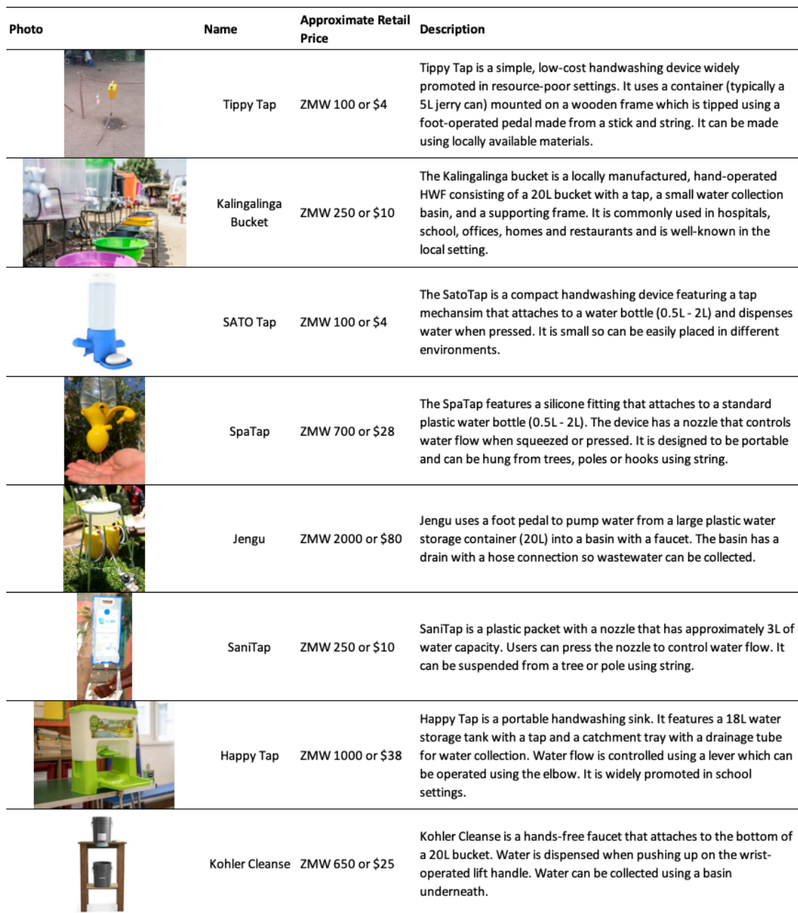
106 Figure 1 | Summary of handwashing facilities included in the study.

101 Following a scoping exercise, a total of eight HWFs were identified for use in the study: Tippy Tap, 102 Kalingalinga bucket, SatoTap, SpaTap, Jengu, SaniTap, HappyTap and Kohler Cleanse (Figure 1) (Jengu 103 2024; Kohler 2024; mWater 2021; Revell & Huynh, 2018; SaniTap 2024; SNV 2020; SpaTap 2024). 104 Selected facilities were those that were or could be manufactured locally (TippyTap, Kalingalinga 105 Bucket) or were available from the manufacturer and could be shipped to the study site in Zambia.