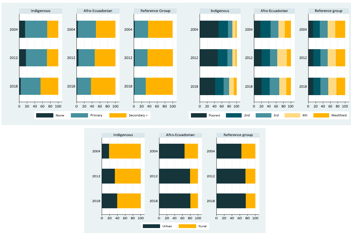
Figure 2. Equiplot coverage and magnitude of inequalities by ethnic groups (2004- 2018)