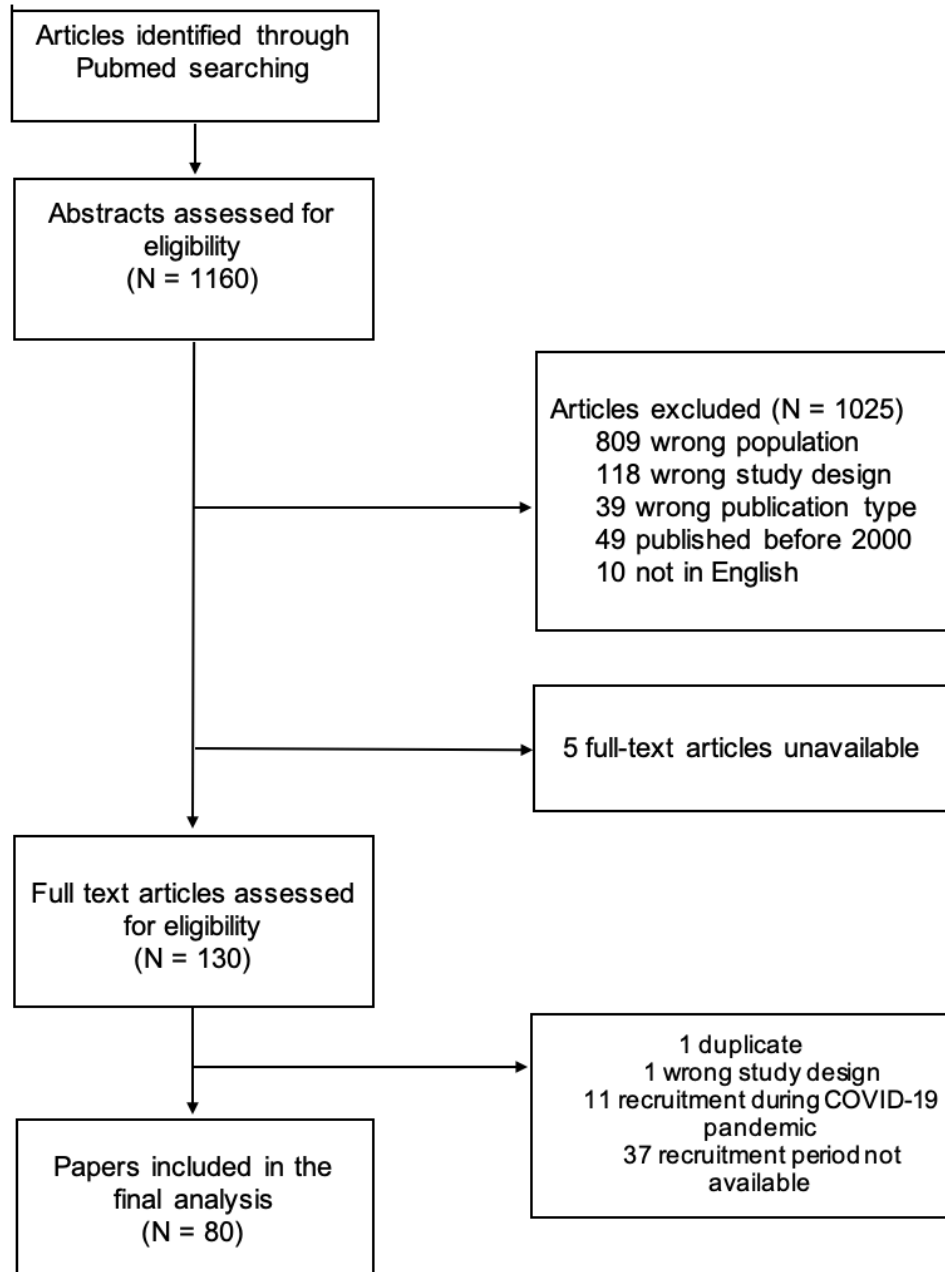
Figure 1. Flow-chart of search strategy.